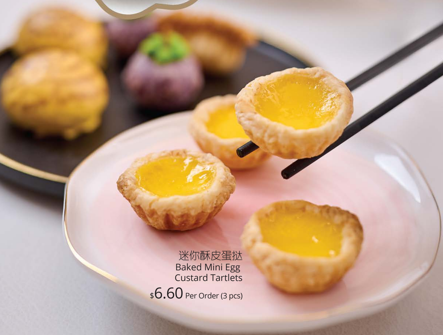
迷你酥皮蛋挞 Baked Mini Egg Custard Tartlets $6.60 Per Order (3 pcs)