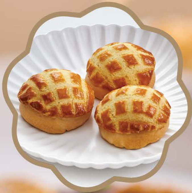
菠萝叉烧包 Baked Honey Pork Bun with Pineapple $6.90 Per Order (3 pcs)