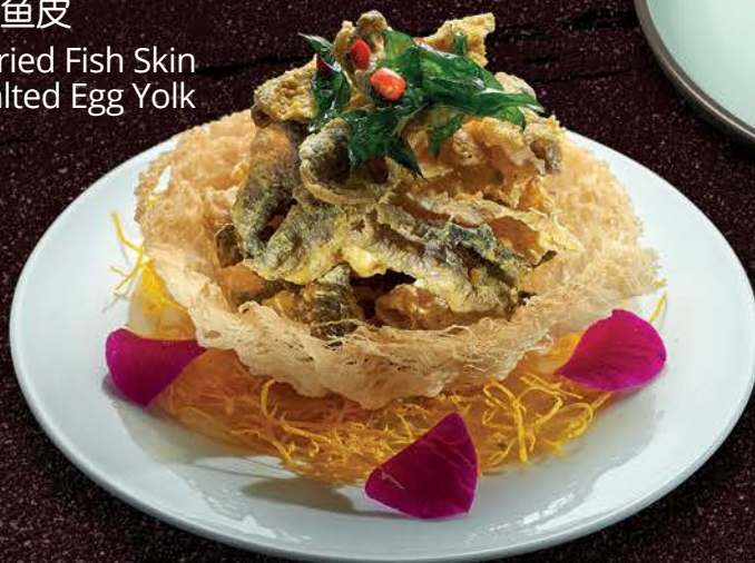
黄金炸鱼皮 Deep-fried Fish Skin with Salted Egg Yolk