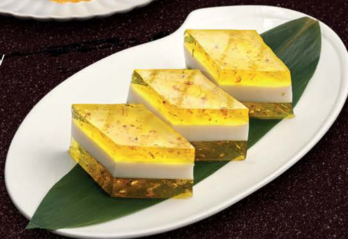
清凉白玉冰 Chilled Refreshing Jelly Royale