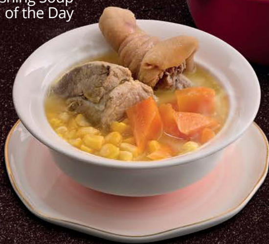
嘉和老师傅靓汤 Double-boiled Nourishing Soup of the Day