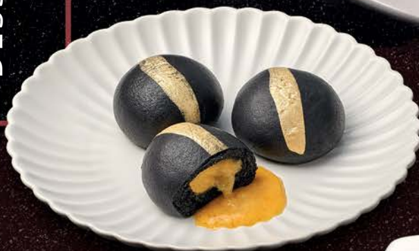
黑金流沙奶黄包 Steamed Creamy Custard Bun