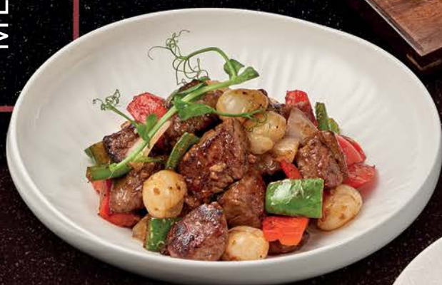
黑椒龙眼爆炒安格斯牛仔粒 Wok-fried Angus Beef Cube with Black Pepper and Longan