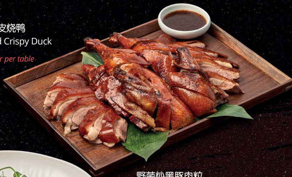
野菌炒黑豚肉粒 Sautéed Kurobuta Pork Cube with Wild Mushroom