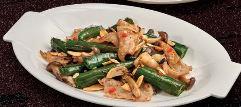
蒜片青尖椒松菇炒猪颈肉 Wok-fried Pork Collar with Green Peppers, Shimeji Mushroom and Crisp Garlic