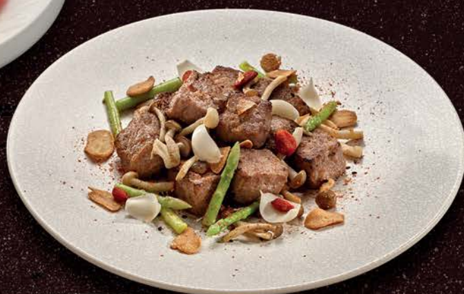
镇江醋香西班牙猪柳 Wok-fried Iberico Pork Fillet with Dark Vinegar Sauce