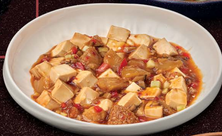
鱼香茄子豆根煲 Braised Eggplant with Fresh Gluten Puff and Salted Fish in Sichuan Style