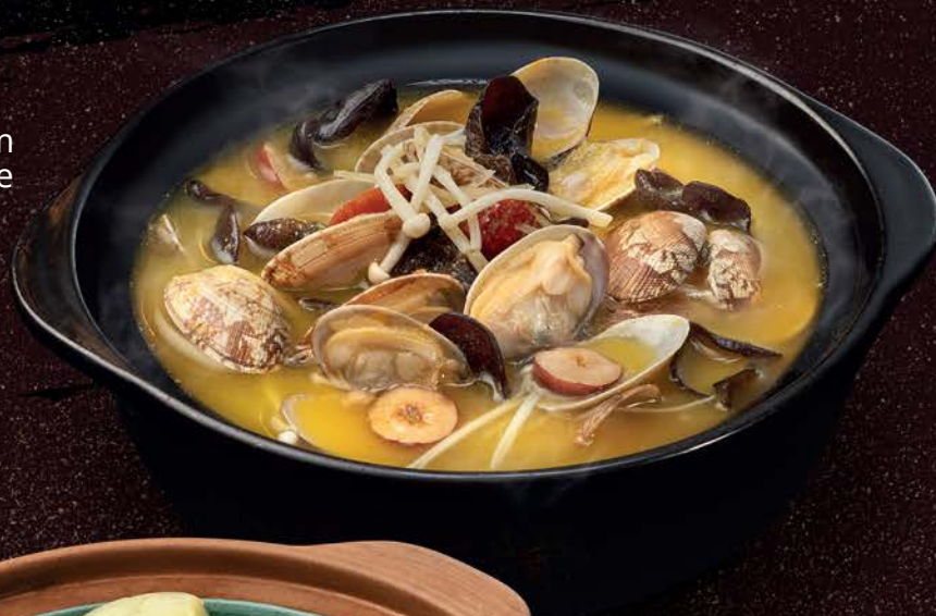
黄酒云耳浸花蚬 Poached Sea Clam with Chinese Wine and Fungus