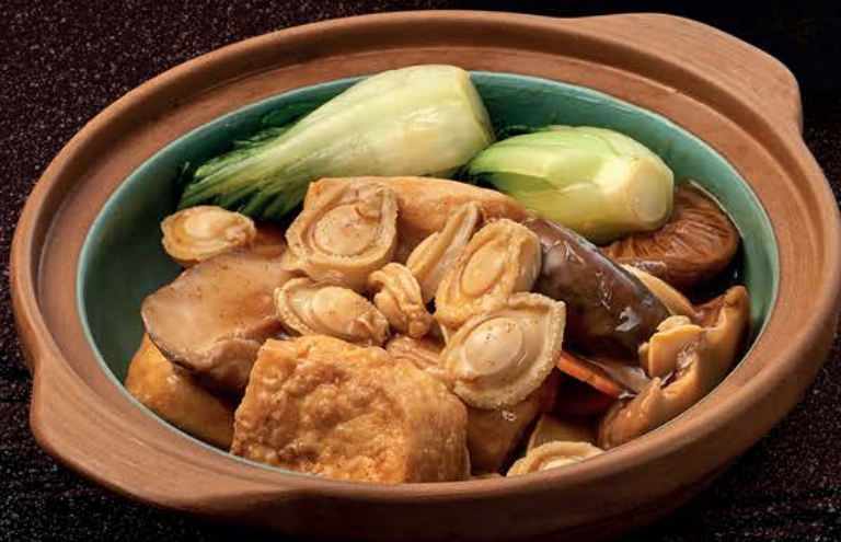
红烧虾子迷你鲍鱼仔豆腐煲 Braised Petite Abalone with Shiitake Mushroom, Beancurd and Prawn Roe