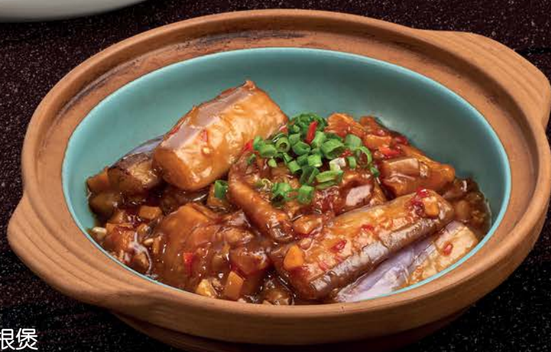
鱼香茄子豆根煲 Braised Eggplant with Fresh Gluten Puff and Salted Fish in Sichuan Style