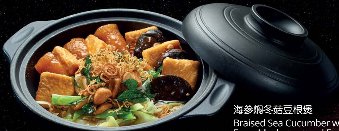
海参焖冬菇豆根煲 Braised Sea Cucumber with Farm Mushroom and Fresh Gluten Puff in Claypot